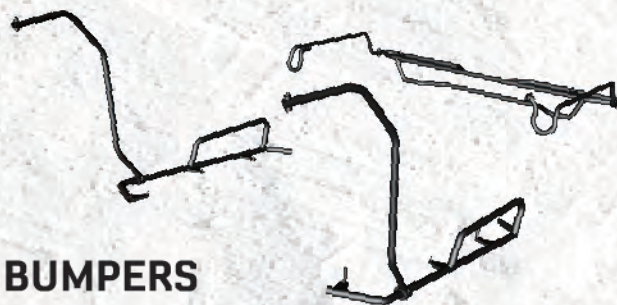
MIDDLE AND REAR BUMPERS