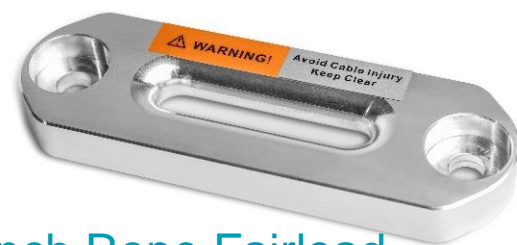
Winch Rope Fairlead 7030-150701