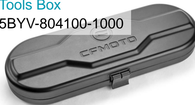
Tools Box 5BYV-804100-1000