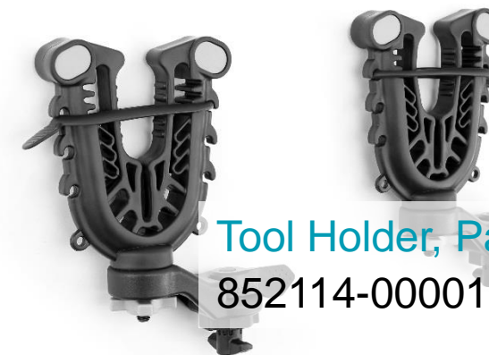
Tool Holder, Pair 852114-00001